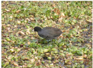
2016 1 st Place Youth Wildlife Wading Around Dorion McFadden