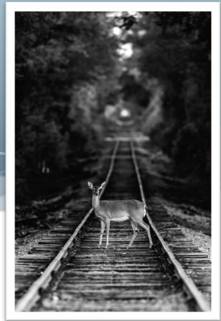
2016 Best In Show Deer on Railway Track Mohan Krishna

New for 2017 Youth category only requires electronic submission!